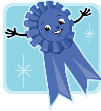
Blue Ribbon Campaign

In 1989, the Blue Ribbon Campaign to Prevent Child Abuse had its early beginnings. A Virginia grandmother used the blue ribbon to pay tribute to her grandson who died as a result of abuse. She tied a blue